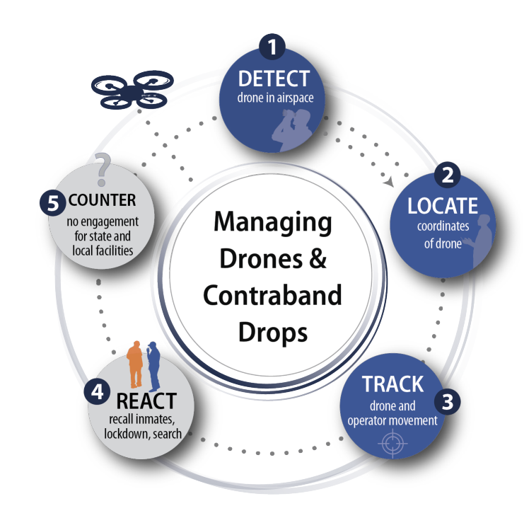
Figure 4: Products and services can help facilities assess drone threats and implement systems to detect, locate, and track drones and operators to enable an operational response within the facility and with local law enforcement.

Drone detection systems may be able to (1) sense the presence and location of a drone,<sup>30</sup> including, in some cases, altitude, speed, and drone make/model/ID, as well as (2) detect and track drone pilot location and movement. These systems can help provide warnings and alerts to enable reaction by personnel and capture and retain information about the drone intrusion as evidence in any future legal cases.